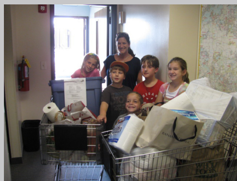
Students of the JCYS Northwest Center held a food drive at the center; collected and delivered over 5 shopping carts of food. Vernon Township wishes to thank everyone for their hard work.

See page 8 for 2014 Summer Camp information