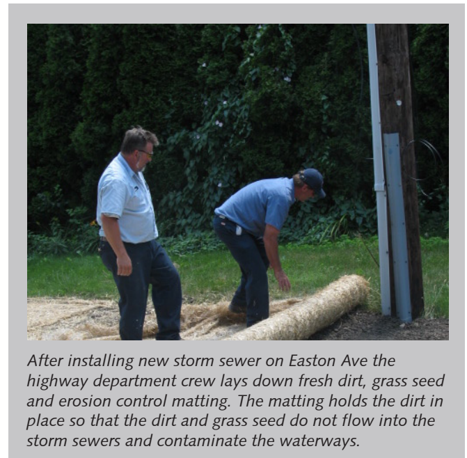
After installing new storm sewer on Easton Ave the highway department crew lays down fresh dirt, grass seed and erosion control matting. The matting holds the dirt in place so that the dirt and grass seed do not flow into the storm sewers and contaminate the waterways.