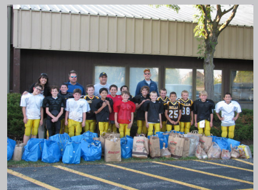
The Buffalo Grove Bills Football League held a competition to see which team could collect the most food for the pantry. Pictured is the winning team with just some of the food that was collected. A special thank you goes to all that shared in the competition.